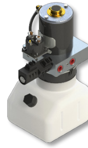
RT-39071/2 HYDRAULIC PUMP w/ SINGLE VALVE 12/24 V