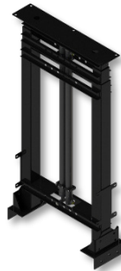
RT-39028 2 STAGE STEEL HOUSING COMPLETE