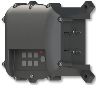
RT-19185/6 BLACK BOX w/ REMOTE 12/24 V