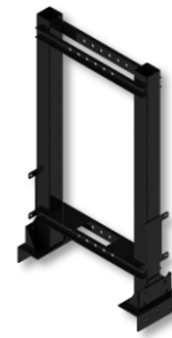
RT-39173 2 STAGE BOTTOM TOWER SECTION