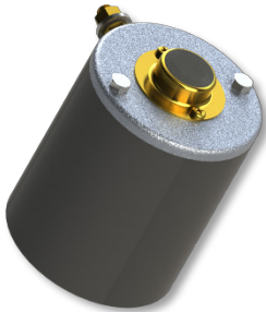
RT-39410/5 REPLACEMENT MOTOR FOR PUMP 12/24 V