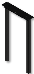
RT-39168 2 STAGE UPPER TOWER SECTION