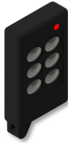
RT-19801 SPARE 6 BUTTON KEYFOB