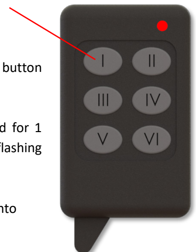
Figure 2: Keyfob button press